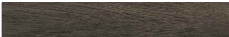
Paramo-R Antracita G.176