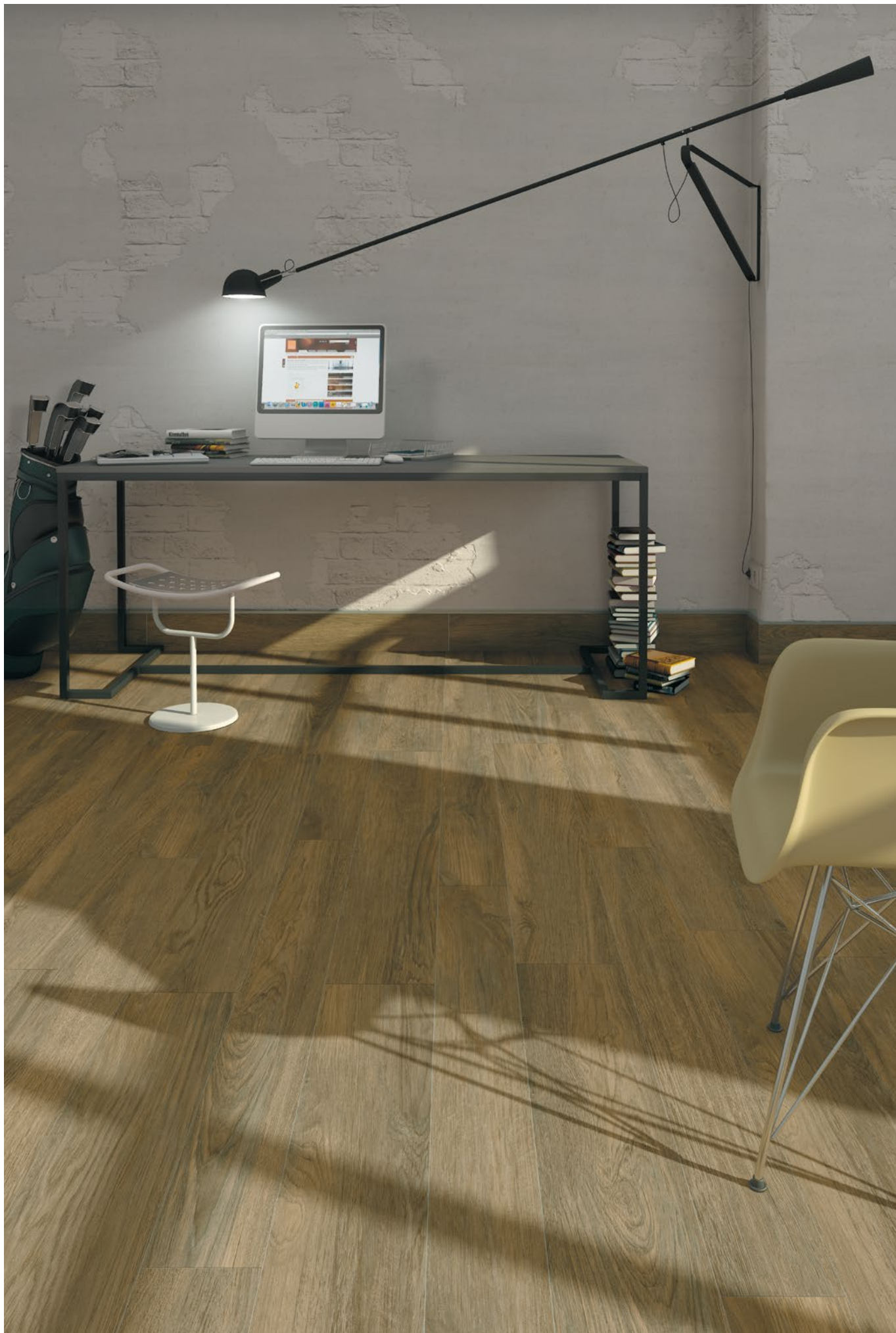
Paramo-R Beige - 14,3x119,3 cm. / 19,2x119,3 cm. / Rodapié - 9,4x59,3 cm.